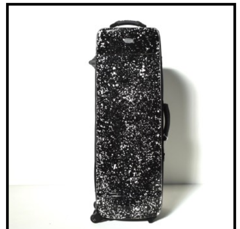
FUSION NEGRO - BLACK FUSION FUSION NOIR - SCHWRAZ FUSION