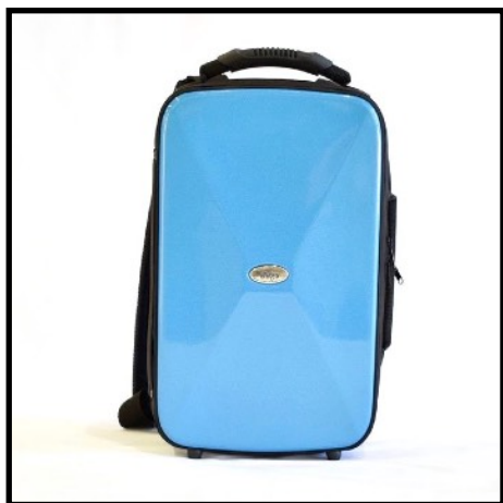
AZUL - BLUE BLEU - BLAU