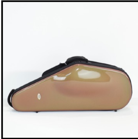
TABACO - TOBACCO TABAC - TABAK