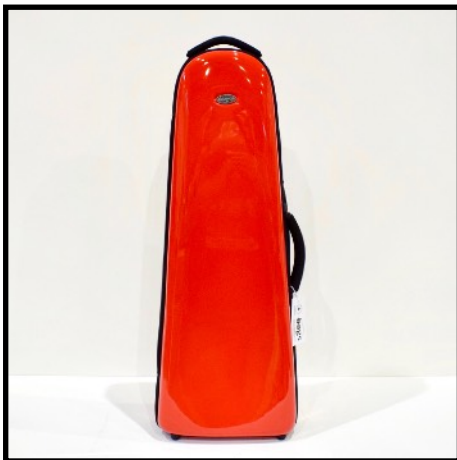
ROJO - RED ROUGE - ROT