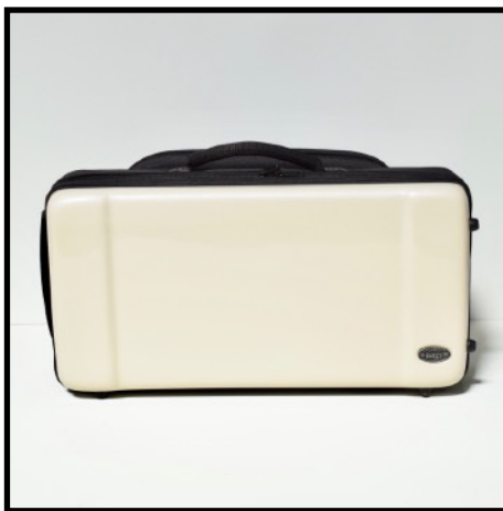
NACAR - NACRE NACRE - PERLMUTT