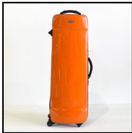
NARANJA - ORANGE