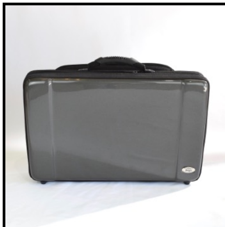
GRAFITO - GRAPHITE GRAPHIT