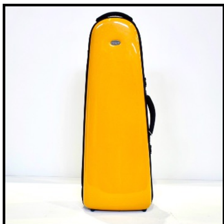
ORO - GOLD OR - GOLD