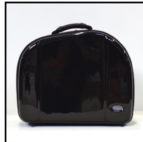
NEGRO - BLACK NOIR - SCHWRAZ