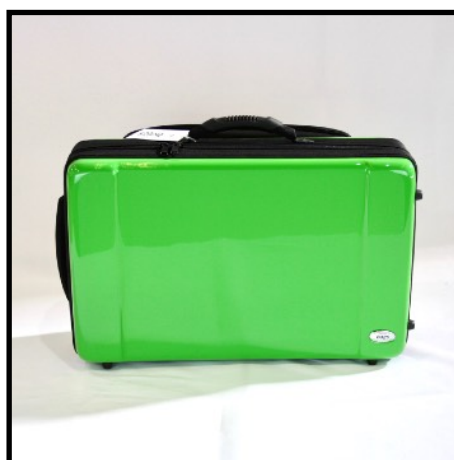
VERDE - GREEN VERT - GRÜN