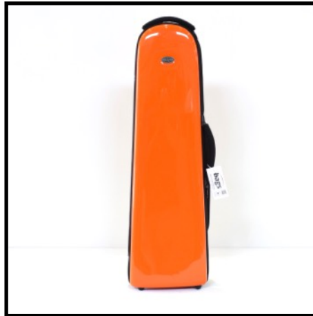
NARANJA - ORANGE