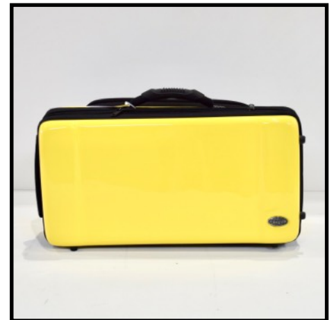
AMARILLO - YELLOW JAUNE - GELB