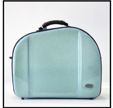
AZUL/VERDE - BLUE/GREEN BLEU/VERT - BLAU/GRÜN