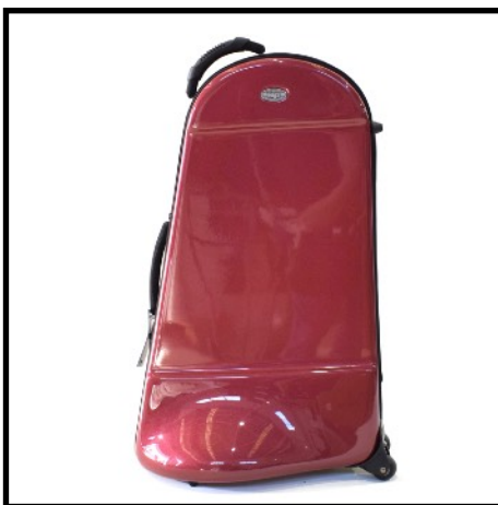
ROJO - RED ROUGE - ROT