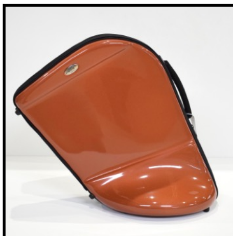
COBRE - COPPER CUIVRE - KUPPER