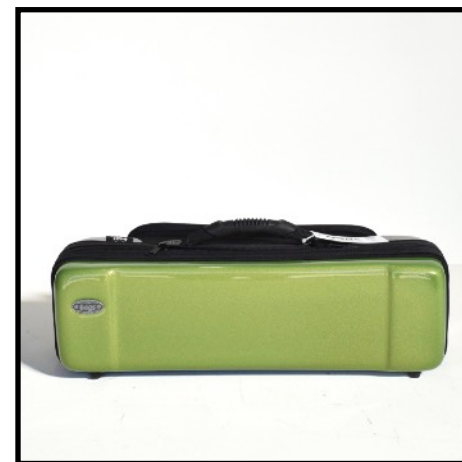
VERDE - GREEN VERT - GRÜN