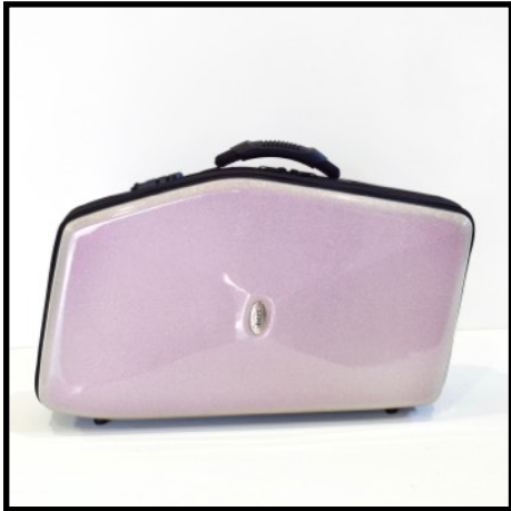
ROSA - PINK ROSE - ROSA