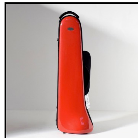
ROJO CLARO - LIGHT RED ROUGE CLAIR - HELLROT