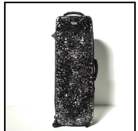
FUSION NEGRO - BLACK FUSION FUSION NOIR - SCHWRAZ FUSION