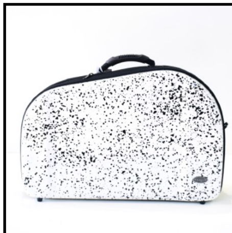
FUSION BLANCO - WHITE FUSION FUSION BLANC - WEISS FUSION