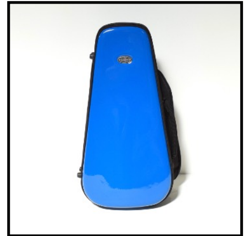
AZUL - BLUE BLEU - BLAU