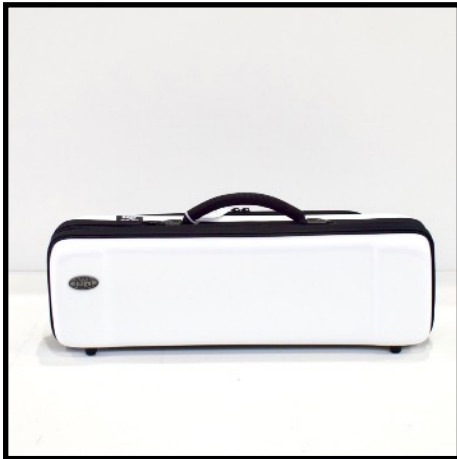
BLANCO - WHITE BLANC - WEISS